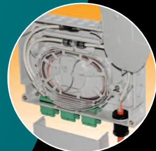
Customer Premises Equipment