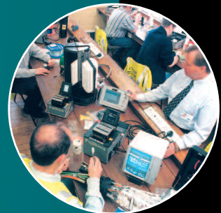
Fusion Splicing Techniques